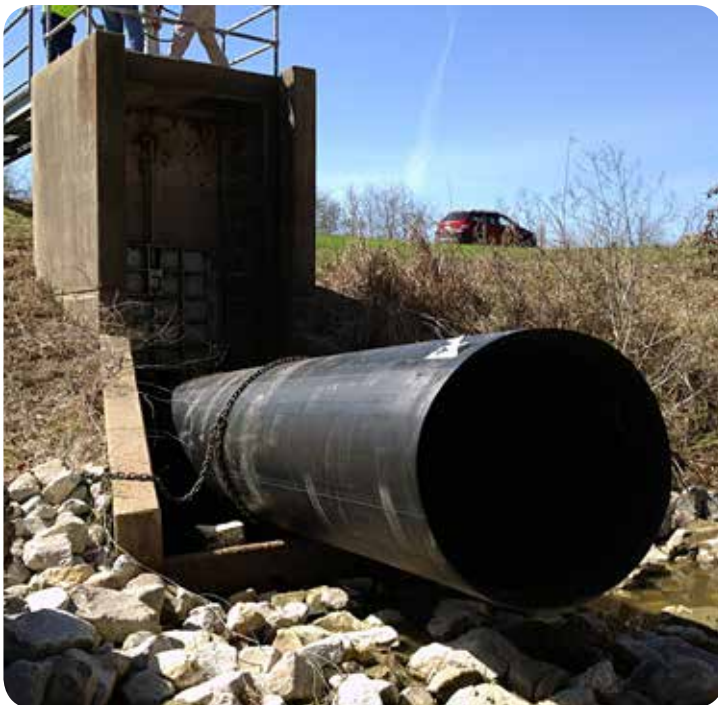
Snap-Tite HDPE pipe is used to line a failing culvert within a levee system.

“The Snap-Tite pipe was reviewed by another Corps district and was determined to be an acceptable product for lining pipes, likewise our district is using Snap-Tite,” Lewis said. “By lining CMPs, we hope to extend the life cycle of our existing structures. We will extend the life of our structures and reduce the cost of our backlog maintenance work.”