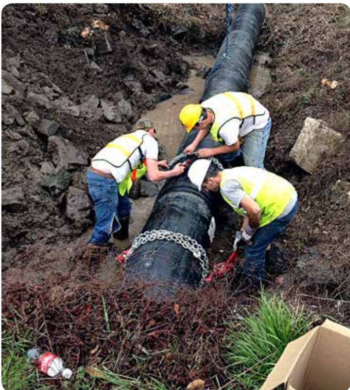
A construction crew installs Snap-Tite HDPE pipe liner into a CMP that is part of a levee system in the Southern United States.

A unique feature of Snap-Tite is that it does not require fusion to join the HDPE pipe together. The ends of the Snap-Tite pipe are machined on each