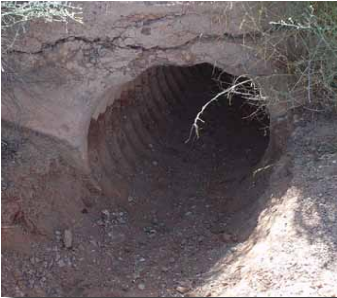
The deteriorated corrugated metal culvert in need of repair.

Snap-Tite's unique "snap" joint does not require any mechanical joints or a fusion process to join the pipe, increasing the speed and ease of installation. As each Snap-Tite pipe length is slid into place, the male end is connected to the female end of the preceding pipe section. The pipe, once slid inside of the old culvert, is then grouted into place. The Snap-Tite joint also features a water tight gasket to withstand the grouting application. In addition, once lined with Snap-Tite, the culvert has an increased flow rate even though the diameter of the pipe is smaller than before.