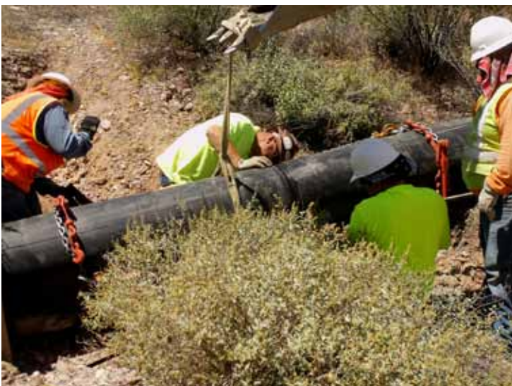
The Snap-Tite pipe 'snap' taking place on location at the culvert relining.

Snap-Tite's unique "snap" joint does not require any mechanical joints or a fusion process to join the pipe, increasing the speed and ease of installation. As each Snap-Tite pipe length is slid into place, the male end is connected to the female end of the preceding pipe section. The pipe, once slid inside of the old culvert, is then grouted into place. The Snap-Tite joint also features a water tight gasket to withstand the grouting application. In addition, once lined with Snap-Tite, the culvert has an increased flow rate even though the diameter of the pipe is smaller than before.